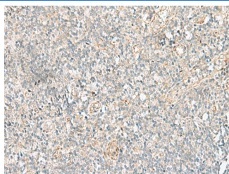
Immunohistochemistry of paraffin-embedded Human tonsil tissue using GSKIP Polyclonal Antibody at dilution of 1:55(×200)