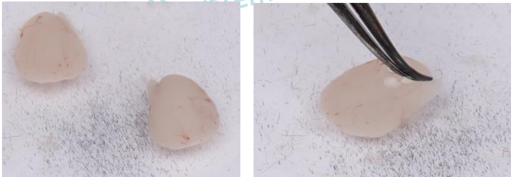
Figure 5 Flip the separated brain again Figure 6 Tear open part of the meninges