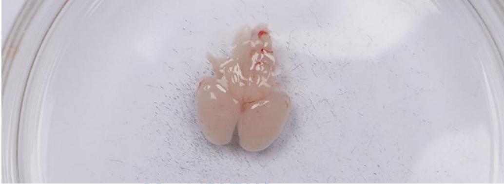
Figure 1 Separated brain