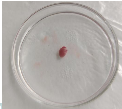
Figure 1. Fresh cardiac tissue