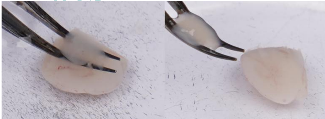
Figure 4 Separate the essence and retain the cerebral cortex