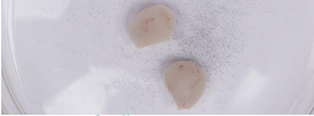
Figure 3 Flip the separated brain