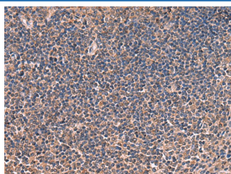
Immunohistochemistry of paraffin-embedded Human tonsil tissue using ITIH4 Polyclonal Antibody at dilution of 1:30(×200)