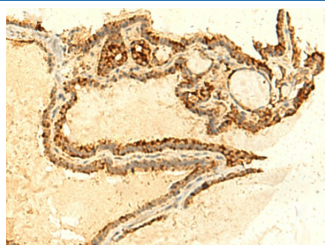
Immunohistochemistry of paraffin-embedded Human thyroid cancer tissue using UNKL Polyclonal Antibody at dilution of 1:50(×200)