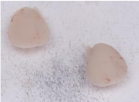
Figure 5 Flip the separated brain again