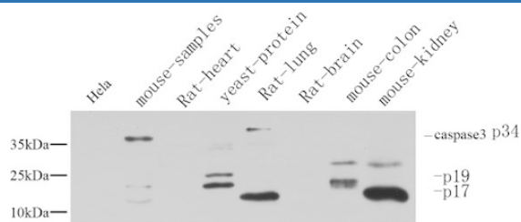
Western Blot analysis of various cells using Cleaved-CASP3 p17 (D175) Polyclonal Antibody at dilution of 1:1000.