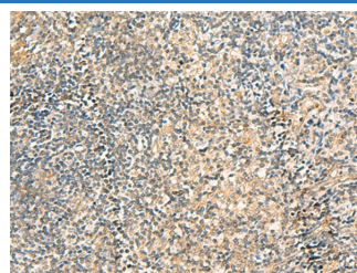
Immunohistochemistry of paraffin-embedded Human tonsil tissue using TXNDC12 Polyclonal Antibody at dilution of 1:50(×200)