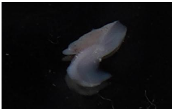
Figure 5. Excised articular cartilage tissue