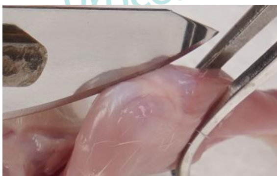
Figure 2b. Locate the patella and cut around the patella to expose the articular cavity