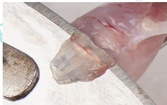
Figure 4b. Using scalpel to excise the articular cartilage tissue