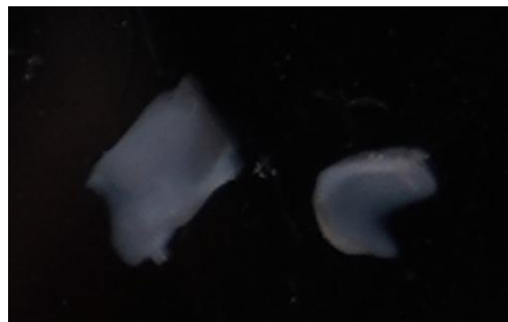
Figure 6. Cleaned articular cartilage tissue