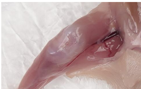
Figure 1. Peel the skin of legs and abdomen