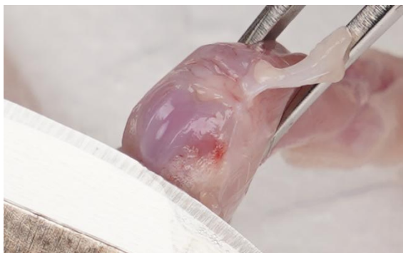
Figure 4a. Using scalpel to excise the articular cartilage tissue.