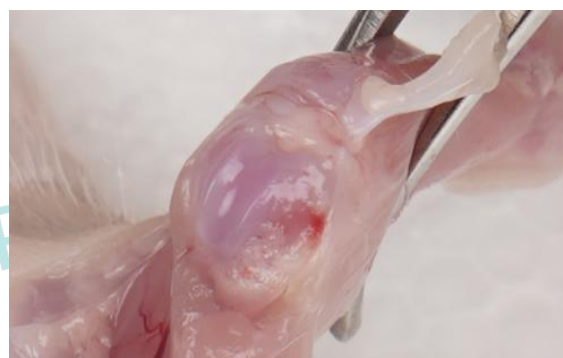
Figure 2c. Locate the patella and cut around the patella to expose the articular cavity