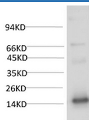
Western Blot analysis of Human Serum using TTR Monoclonal Antibody at dilution of 1:2000.