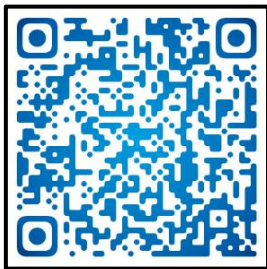
Wechat of technical support

If you have any technical problems, please feel free to contact our technical support (it is recommended to take pictures and save the experimental data in time. Keep the used plate and remaining reagents).