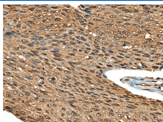
Immunohistochemistry of paraffin-embedded Human esophagus cancer tissue using CALML5 Polyclonal Antibody at dilution of 1:70 (x200)