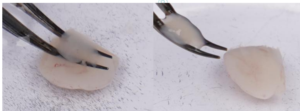
Figure 4 Separate the essence and retain the cerebral cortical