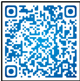
Wechat of technical support

If you have any technical problems, please feel free to contact our technical support (it is recommended to take pictures and save the experimental data in time. Keep the used plate and remaining reagents).