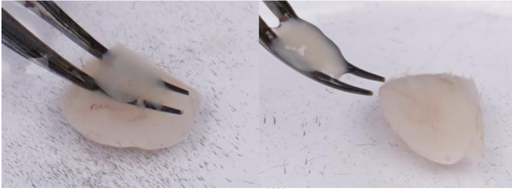
Figure 4 Separate the essence and retain the cerebral cortex