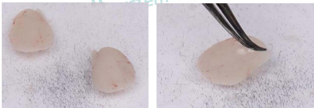
Figure 5 Flip the separated brain again Figure 6 Tear open part of the meninges