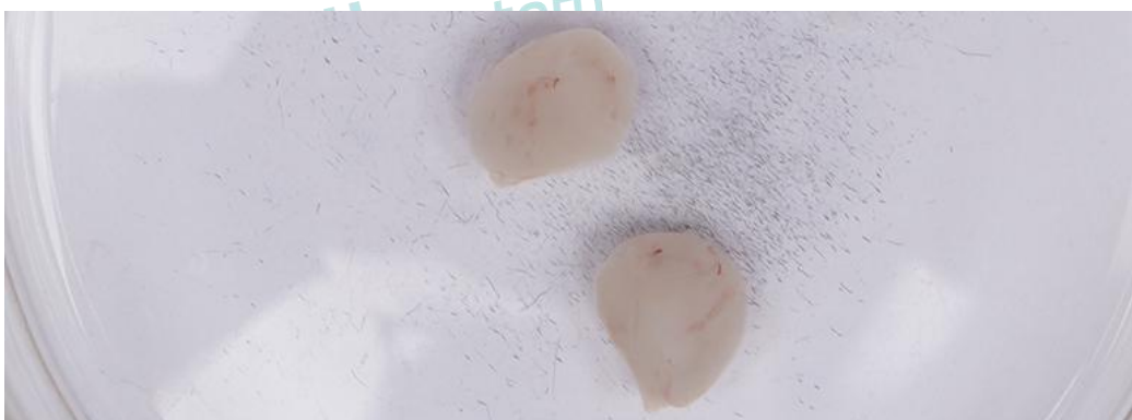
Figure 3 Flip the separated brain