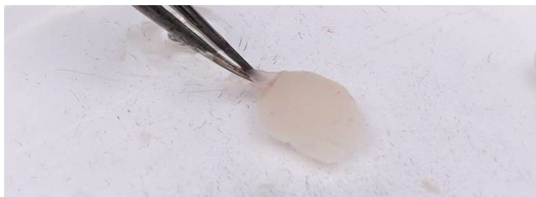
Figure 7 Stabilize the tissue with the left hand, and gently pull to strip off the meninges