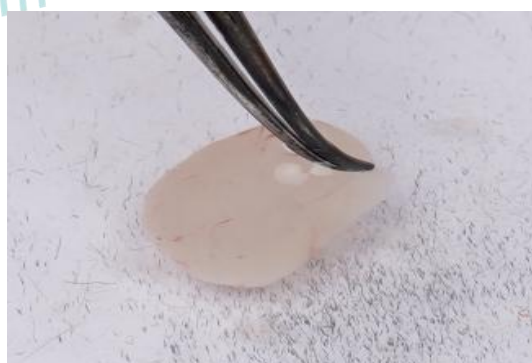
Figure 6 Tear open part of the meninges