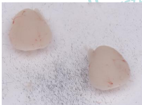
Figure 5 Flip the separated brain again