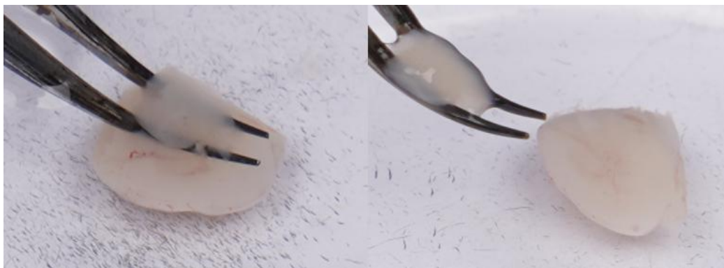
Figure 4 Separate the essence and retain the cerebral cortex