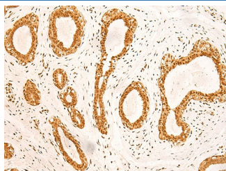
Immunohistochemistry of paraffin-embedded Human breast cancer tissue using ZNF471 Polyclonal Antibody at dilution of 1:50(×200)