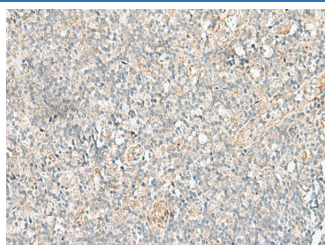
Immunohistochemistry of paraffin-embedded Human tonsil tissue using GSKIP Polyclonal Antibody at dilution of 1:55(×200)