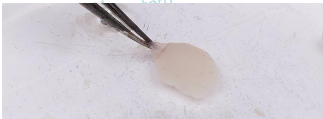
Figure 7 Stabilize the tissue with the left hand, and gently pull to strip off the meninges