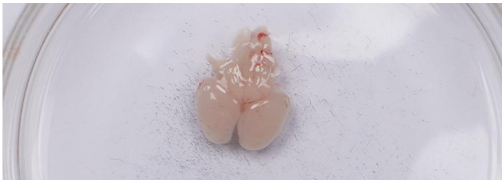
Figure 1 Separated brain