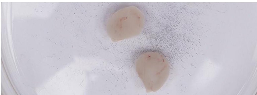
Figure 3 Flip the separated brain