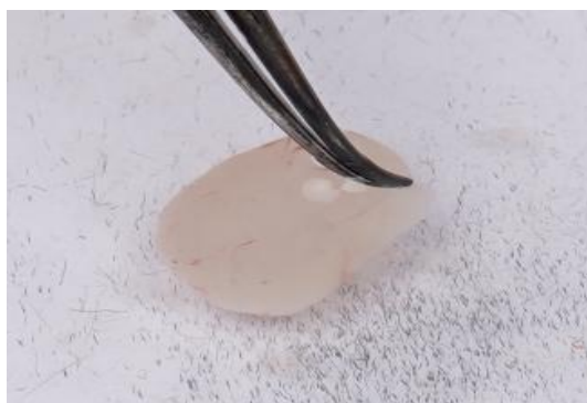
Figure 5 Flip the separated brain again Figure 6 Tear open part of the meninges