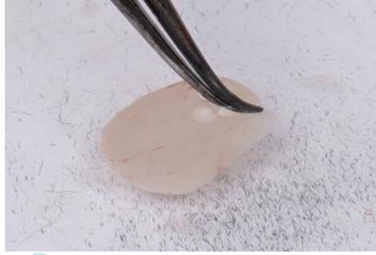
Figure 5 Flip the separated brain again Figure 6 Tear open part of the meninges