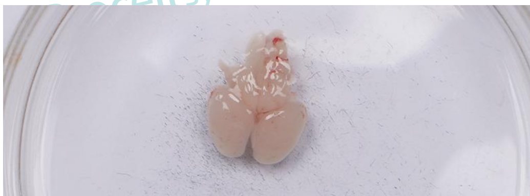
Figure 1 Separated brain