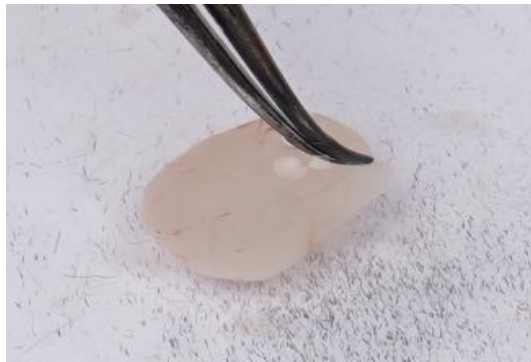
Figure 5 Flip the separated brain again Figure 6 Tear open part of the meninges