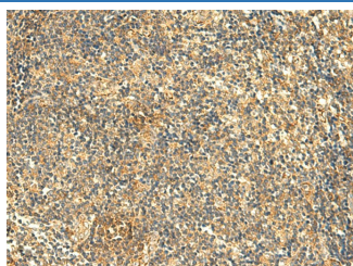
Immunohistochemistry of paraffin-embedded Human tonsil tissue using KIAA0513 Polyclonal Antibody at dilution of 1:50(×200)