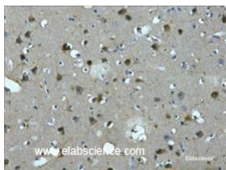
Immunohistochemistry of paraffin-embedded Human brain tissue using MAP2 Monoclonal Antibody at dilution of 1:200.