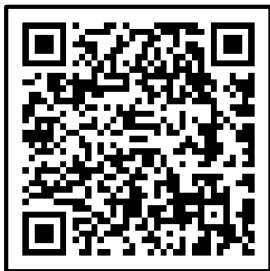
Guidelines for ELISA

If you have any technical problems, please feel free to contact our technical support (it is recommended to take pictures and save the experimental data in time. Keep the used plate and remaining reagents).